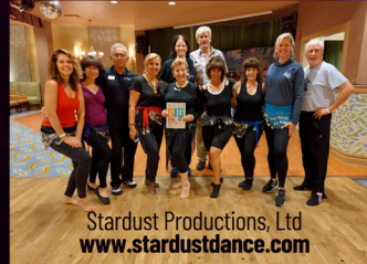
Stardust Productions, Ltd www.stardustdance.com