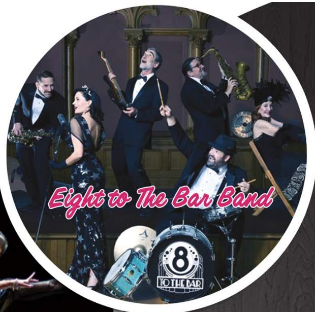
Eight to The Bar Band